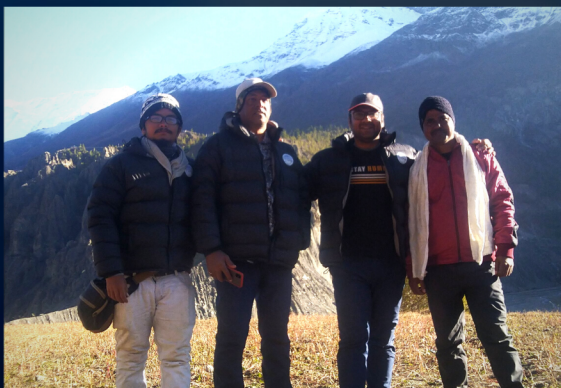
In NEPAL while shooting UUNCHAI, the film

We are pioneers in location sound recording business since 8+ years and delivered finest audio tracks to multiple OTT players - ranging from Amazon Prime Video, Disney Hotstar to Netflix and more. Our Sound Designed films are also available across major OTT platforms.